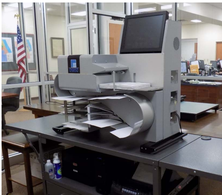
High-speed central count scanner which scans and sorts 14-inch double-sided ballots at 300 per minute.