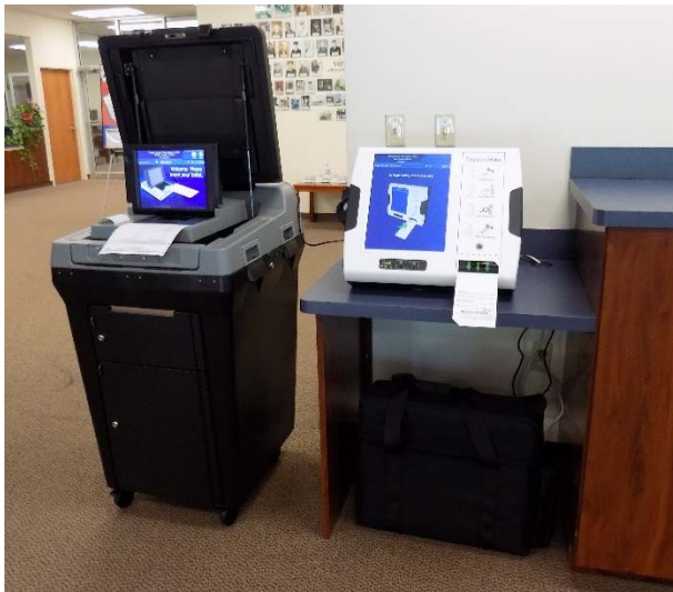
Precinct level tabulator and ballot marking device.

The installation of our new voting system has gone very smoothly. This upgrade was mandated by legislation passed in 2013 which requires all counties in Florida to update their touch screen tabulators. The law states we must only use voting equipment which produces a paper ballot. After 19 years of dedicated service, the old voting system has retired. This has been a massive operation, hours of design, planning, physical labor and now several weeks of training to learn the new system. Enjoy these photos, which highlight the installation and new voting system.