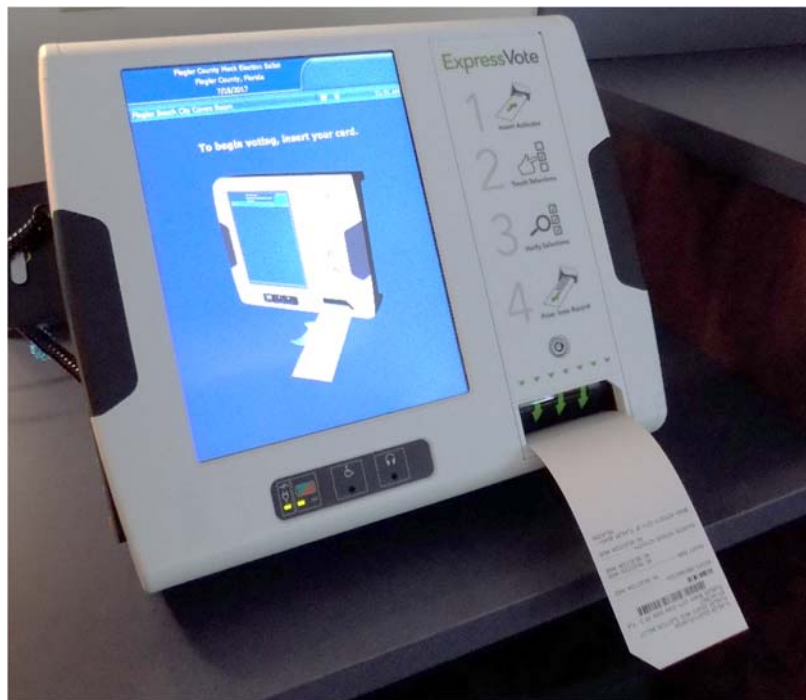
Ballot marking device for voters with disabilities.